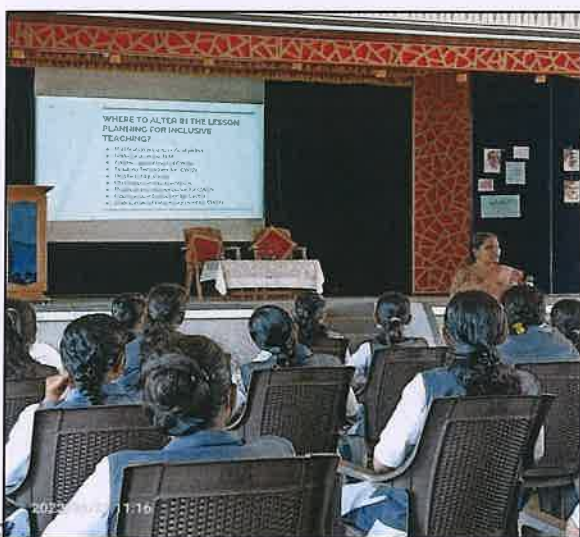
CLASS ON INCLUSION 23/06/2022