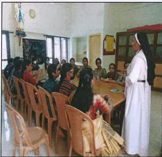
INCLUSIVE PRACTICES 10/11/2022

The institution organizes training workshops, special school visits and Inclusive Training courses and Faculty Development Programmes for teacher educators and teacher trainees in collaboration with Chavara Special School Koonamavu.