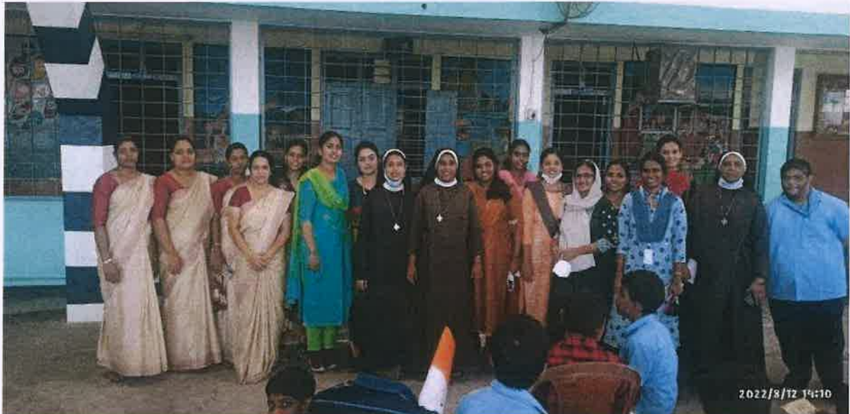
With the Staff of Snehasadan Special School