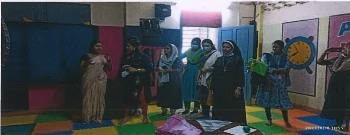
Special Class for a Disabled Child