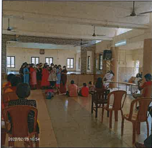
INCLUSIVE PRACTICE 25/02/2022