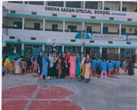
SPECIAL SCHOOL VISIT 12/08/2022

Our teacher trainees also visited Snehasadan Special School and observed the various provisions available for students with differential needs.