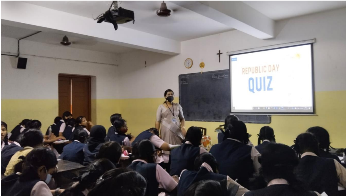
Republic Day quiz during Internship

Kovilvattom Road, Ernakulam, Kochi, Pin – 682035, Kerala (Affiliated to Mahatma Gandhi University, Kottayam)