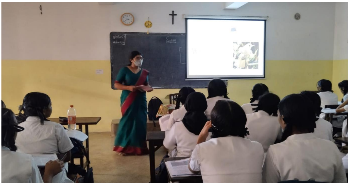
Art Education class -Internship