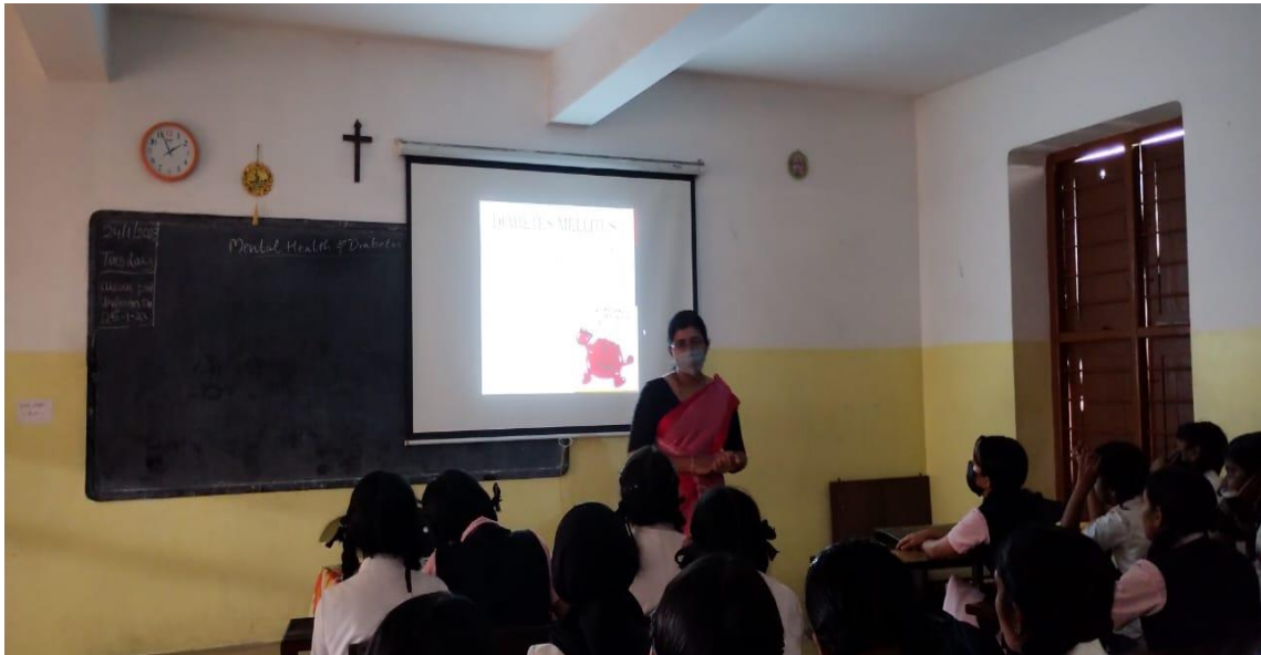
ICT usage during internship class