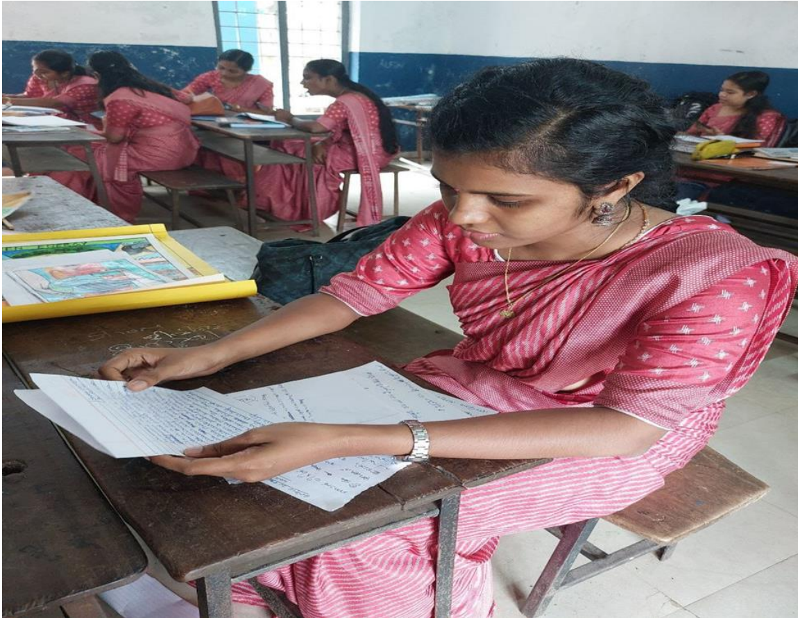
Valuing Answer Scripts Of Termly Exams

This is to certify that following photos are the evidences of Assessment of Student learning done by interneer of St. Joseph College of Teacher Education for Women, Ernakulam