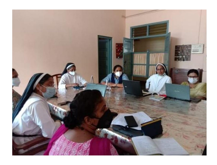
Faculty discussing the PLOs and CLOs of B. Ed Programme