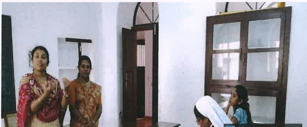
Photo of Training on preparation of digital album