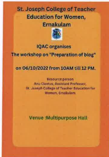
Event poster of the workshop on "Preparation of blog" by Anu Cleetus